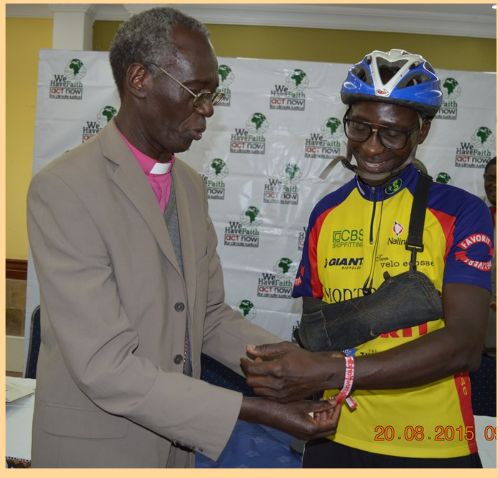
A cyclist receiving a wrist band for the campaign

equitable and ambitious climate agreement. The activists will cycle in a caravan for 6500km starting on 31 August 2015 through South Africa, Botswana, Zimbabwe, Zambia, Malawi, Uganda, Tanzania to Kenya while collecting one million signatures demanding action on climate change. More so the Faith leaders are encouraged to prepare their sermons other messages to their congregations or communities on the theme of environmental stewardship and the role of the church in taking care of the environment as well as encouraging their congregants to support the campaign by signing the petitions