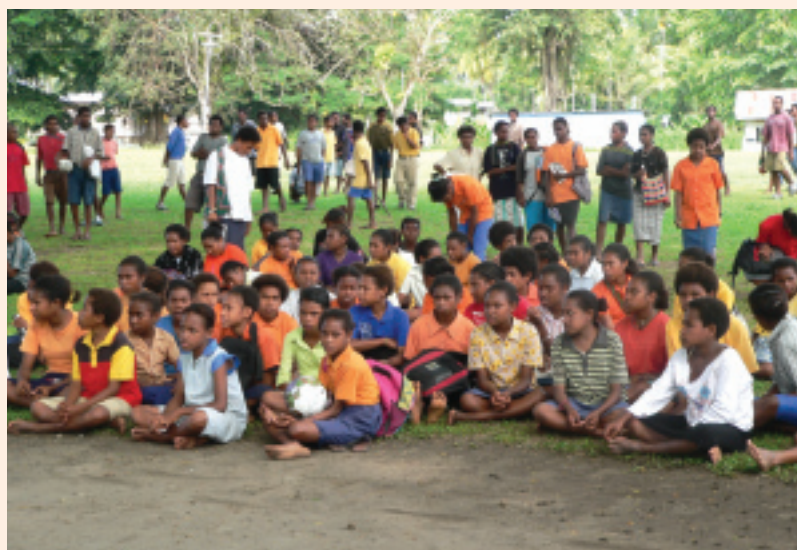
Peer Training helps to dispel superstition and myth about the HIV and AIDS virus – especially amongst young people who will educate future generations.

With the help of the Anglican Health Service of PNG (AHS) the rural dioceses are now gaining the experience and skills to coordinate complex HIV & AIDS programs. The Training of Peer Education Trainers (TOPET) has built the capacity of three (New Guinea Islands, Aipo Rongo and Popondota) rural dioceses to have their own Peer Education (PE) trainers organising and carrying out the PE training in their local communities.