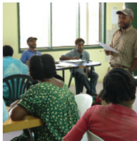
Ongoing training about HIV and AIDS is paramount for those who teach others about the virus.

(Names have been changed to protect the family's identity and also the location is purposely not mentioned.)