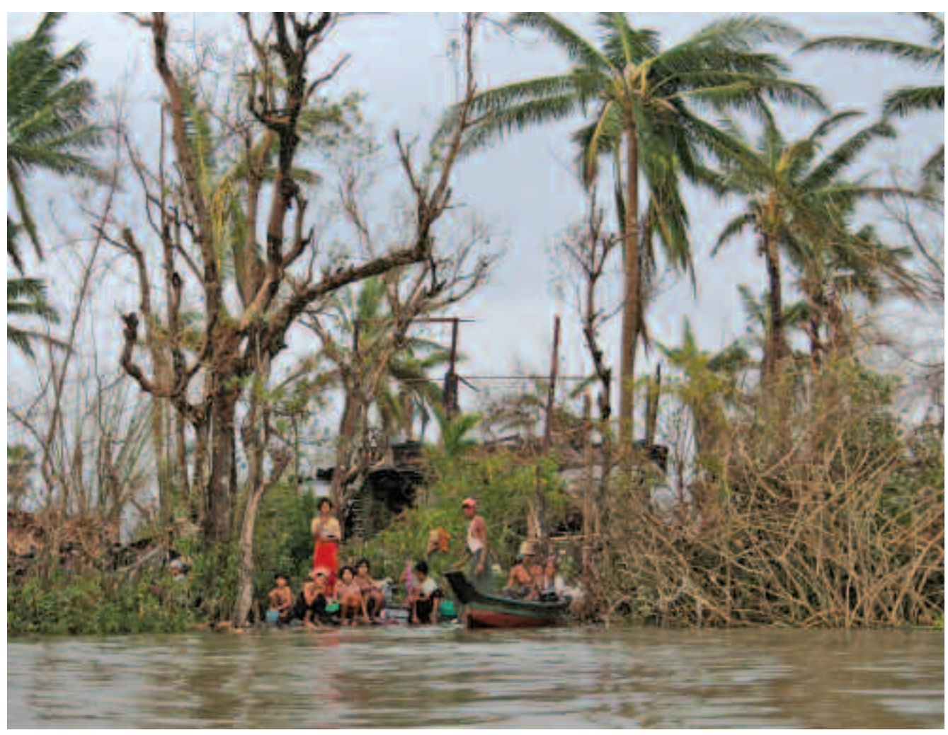
Burmese wait for emergency assistance after Cyclone Nargis hit Myanmar in May 2008.