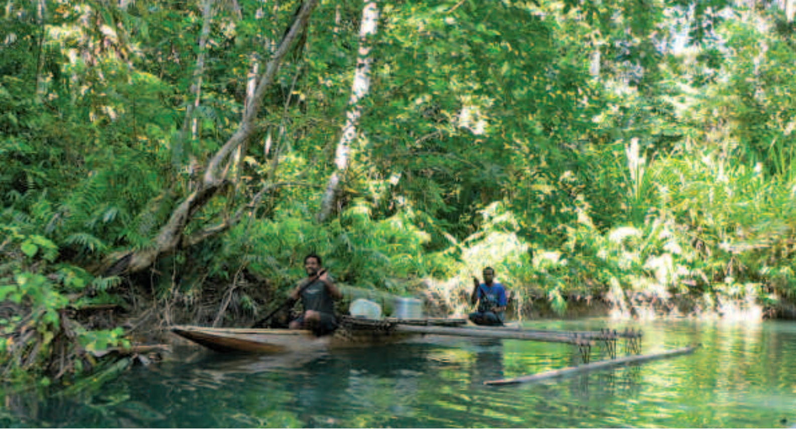
Distributing supplies in Oro Province, Papua New Guinea.