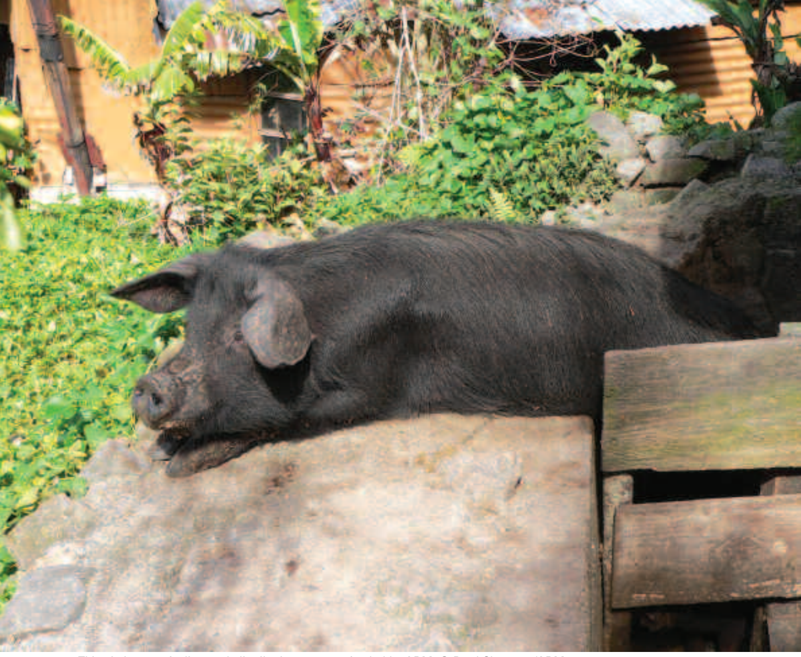
This pig is part of a livestock distribution program funded by ABM.

ABM is supporting this program in the Philippines through a number of activities: