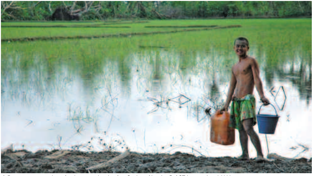
A Burmese man gathers fresh water shortly after Cyclone Nargis.