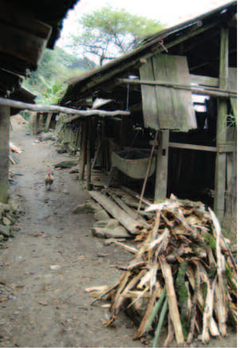
A village in Northern Vietnam.