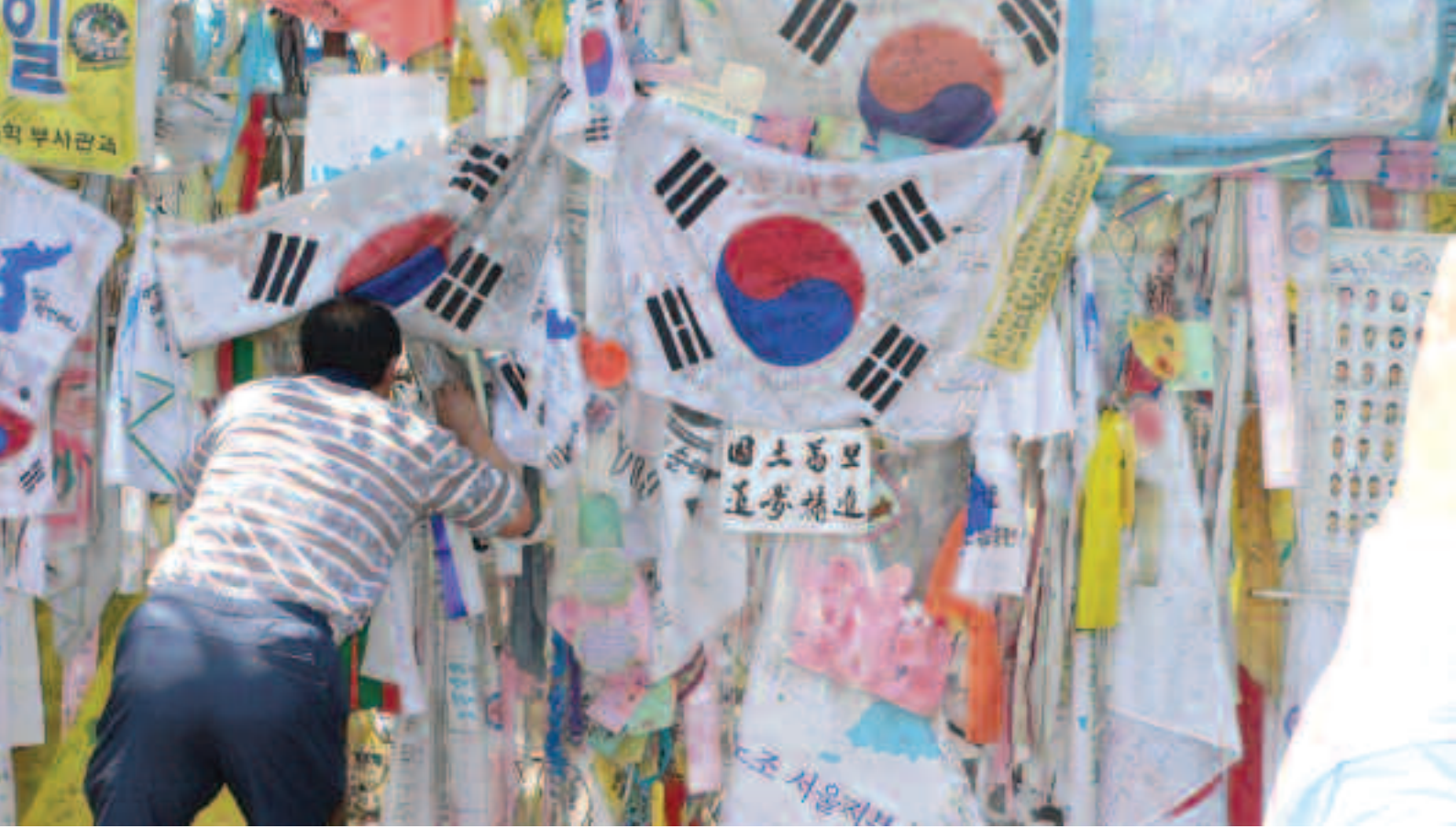
A Korean man at the Bridge of No Return – the farthest point north that South Koreans are permitted to travel.