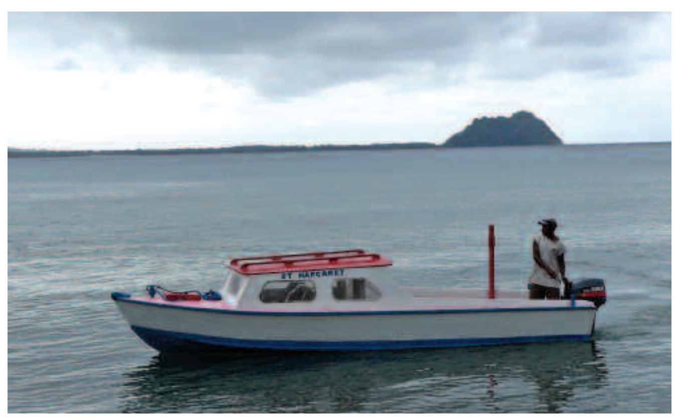
Conducting ministry in the Diocese of Banks and Torres in the Solomon Islands.