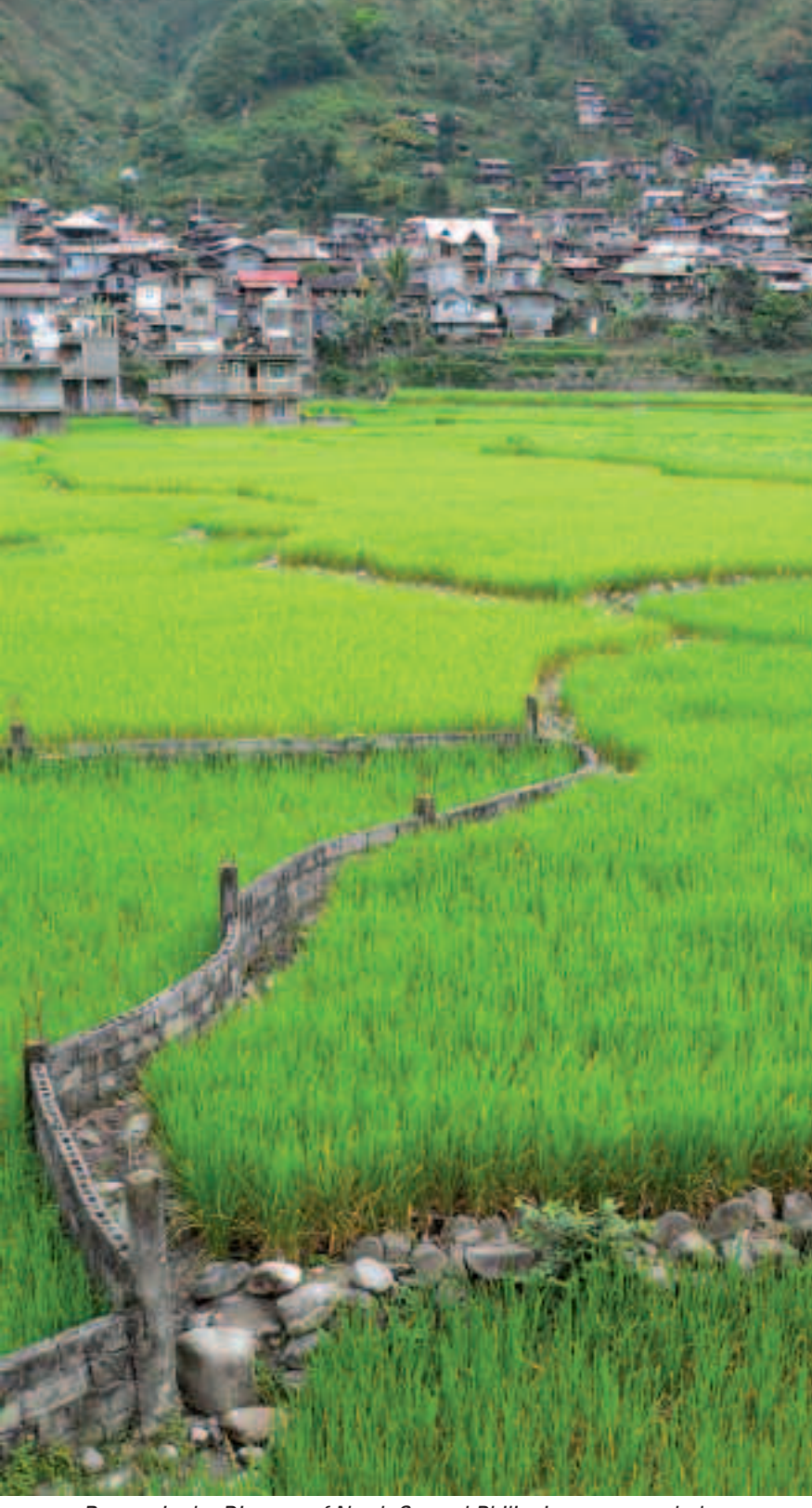
Bontoc in the Diocese of North Central Philippines surrounded by irrigated rice paddies.

Rural communities struggling to cope need other livelihood activities to compensate for their meagre yields from farming. ABM wants to provide resources that will allow these communities to diversify their produce, consequently improving farm incomes and reducing poverty in rural areas. Expanding the food security project will provide equipment, fertiliser and other provisions. This puts more food on the table and increases household incomes so that families can cover other basic needs such as health and education.