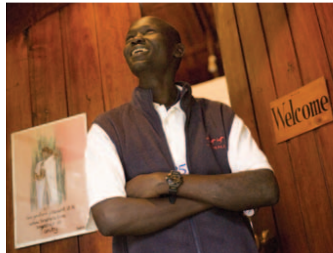
A member of the Anglican Church in Ethiopia welcomes all who come to its doors.

The LORD will guide you always; he will satisfy your needs in a sun-scorched land and will strengthen your frame. You will be like a well-watered garden, like a spring whose waters never fail. – Isaiah 58:10-12