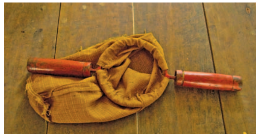
A offering basket in a Church in the Irrawaddy Delta in Myanmar. Donations to the Cyclone Nargis Appeal helped the people here recover from the devastation caused by the disaster.