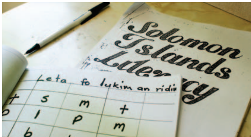
In the Solomon Islands, ABM Auxiliary funds the Mothers' Union to provide literacy classes.

Spirit of Pentecost, when you descended from the heavens the people spoke in many tongues of God's great works. Guide with your wisdom all those who translate the Scriptures or formulate dictionaries so that all your people may have versions in their own tongue. Grant patience to those who teach literacy and perseverance to those who are learning to read. Help us never to take the gift of literacy for granted, nor to withhold it from those whom we are able to help. This we ask through the Word of God, Jesus Christ. Amen.