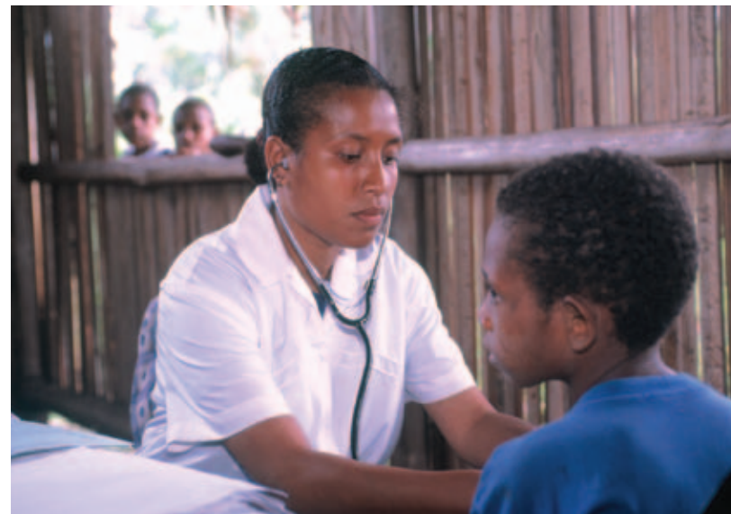
Providing decent healthcare in remote areas is a difficult but invaluable task that saves thousands, if not millions of lives every year.

For I will restore health to you, and your wounds I will heal, says the LORD. – Jeremiah 30:17 (NRSV)