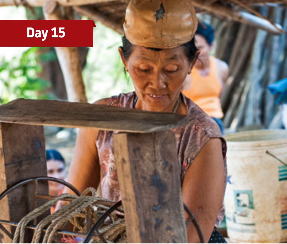
Water project at Myi Ni Gone Village - a lady fetches water from the well.

To the King of the ages, immortal, invisible, the only God, be honour and glory for ever and ever. Amen.