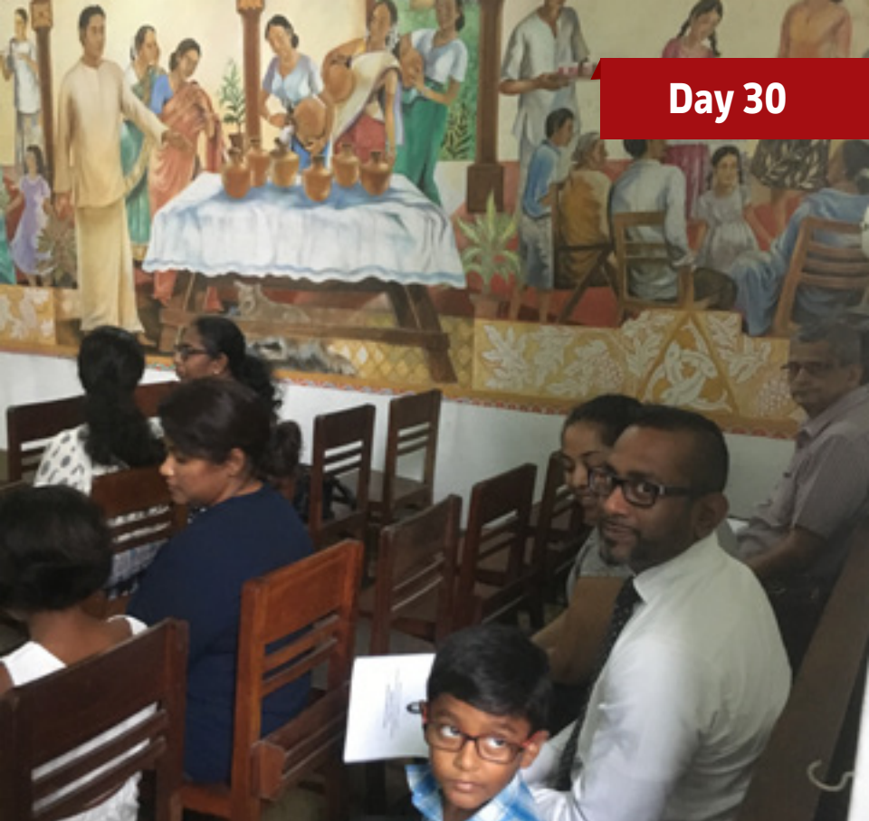
Worshippers in a chapel of the Cathedral of Christ the Living Saviour, Colombo, Sri Lanka.