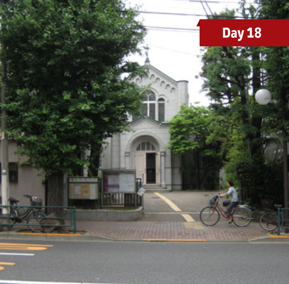
St Cyprian's Chapel, Tokyo.

Jesus said: I am the root and the descendant of David, the bright morning star.