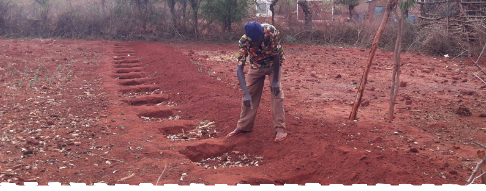
Tree planting and zai pits in Kenya.