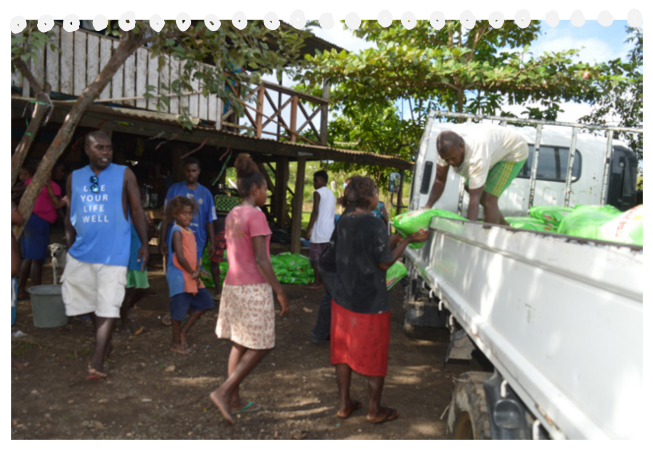
ABM's partner, ACOM, distributes rice to people affected by Cyclone Oma in the Solomon Islands.

ABM contributed AUD$10,000 to each of these responses.