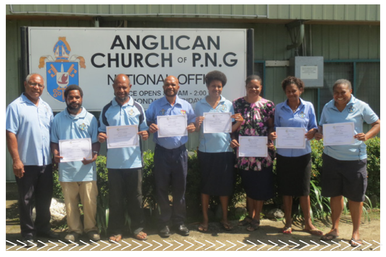
Graduates from the FY 2018/19 Agents of Change course in PNG.

On request by its regional management board, VIMROD management staff has started capacity development workshops in selected dioceses in Visayas and Mindanao in FY2018/19. The main objective of this 3-year initiative is to develop diocesan capacity to implement community projects. Since the trainings started in FY2018-2019, at least one diocese has started implementing projects and has put up its own development desk.