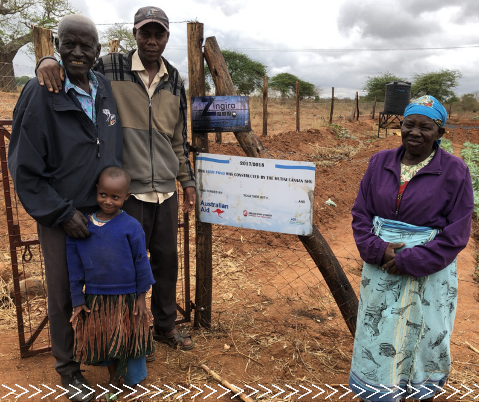
ABM's Livelihoods Improvement Program in Kenya is implemented by Anglican Development Services, Eastern and supported by the Australian Aid Program.