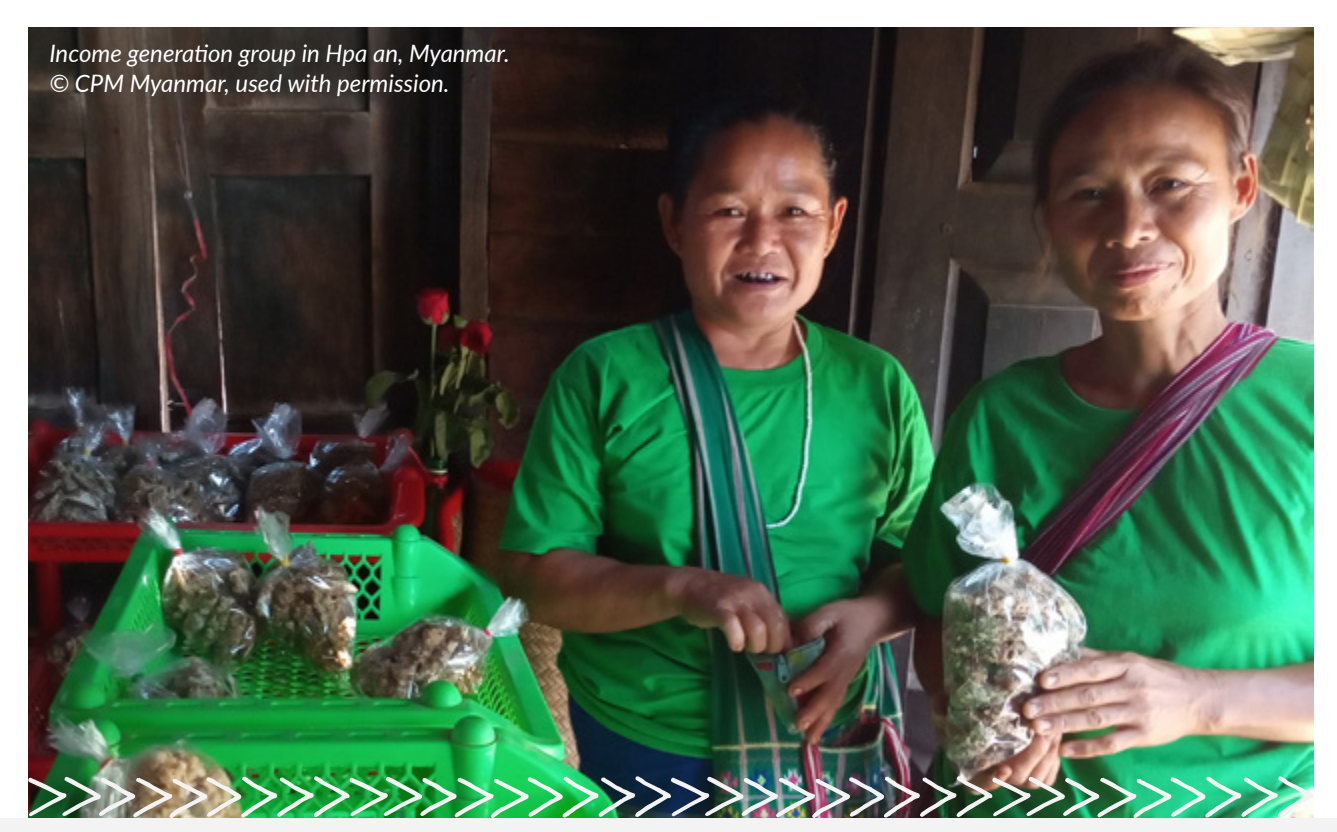
Anglican Board of Mission, Australia • 2018/19 Annual Report

In Myanmar, 77 people in two communities attended training on new agriculture techniques, including making organic fertilisers. The same two communities each formed a village development committee. These committees were assisted to plan economic initiatives, which then received material support in the form of a sesame press, banana trees and a rice mill.