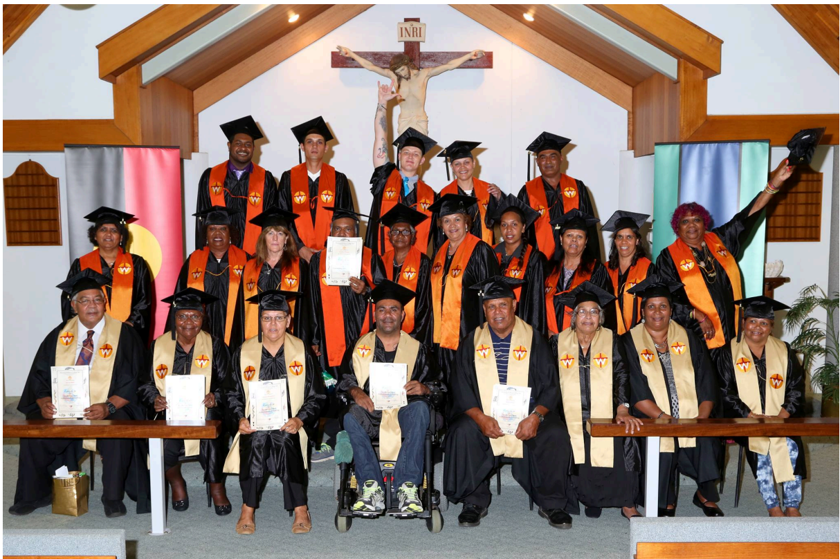
Graduates of the Cert III Alcohol and Community Development and Cert IV Alcohol and Other Addictions Counselling, Wontulp-Bi-Buya, 2014.