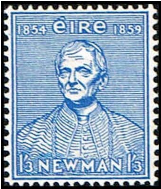
Postage stamp from Ireland featuring John Henry Cardinal Newman. Feast day 11 August.